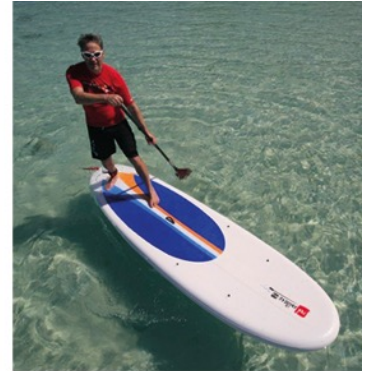
RED PADDLE COMPANY - 2013 INFLATABLE SUPS

Red first touring board launches. Red innovates its first High pressure pump.